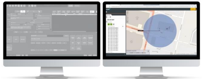
3 rd Party Integration

Don't let information overload hinder your response time. With Intrado Spatial Insight, you're not just responding to calls; you're elevating the standard of emergency response. Dive into a world of precise, clear, and efficient call handling. Activate Spatial Insight for your agency today.